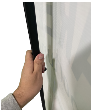
Stand with Banner only

Position banner to the desired position by adjusting the second and third poles length to tighten or loosen the banner. Add optional coro sign topper by sliding into channel of top bracket.