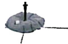
Water Bag & Cross Foot